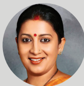
SMRITI IRANI Member of Parliament, Rajya Sabha