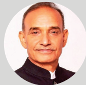
DR. SATYA PAL SINGH Member of Parliament, Lok Sabha