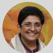
KIRAN BEDI Lieutenant Governor of Puducherry