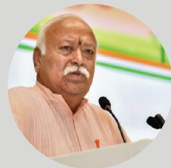
MA. MOHAN BHAGWAT JI Sarsanghachalak (Rashtriya Swayamsevak Sangh)