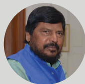
RAMDAS ATHAWALE Member of Rajya Sabha