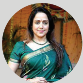
HEMA MALINI Indian actress